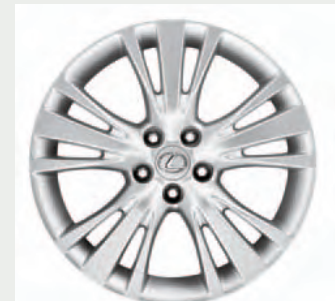
19-inch split-five-spoke alloy wheel 21 AVAILABLE RX 450h