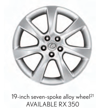
19-inch seven-spoke alloy wheel 21 AVAILABLE RX 350