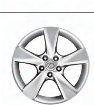
18-inch five-spoke alloy wheel 21 STANDARD RX 350 AND RX 450h