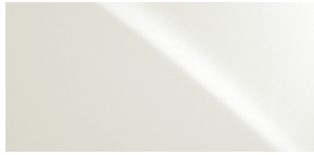
STARFIRE PEARL 0077