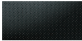
LEATHER - WHITE PERFORATED