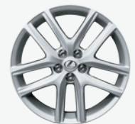
17-inch split 5-spoke alloy wheels – Optional