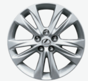
16-inch 10-spoke alloy wheels – Standard