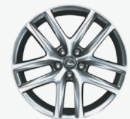
17-inch split 5-spoke alloy wheels with liquid graphite finish – F SPORT