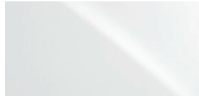
ULTRA WHITE 0083