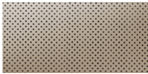
LEATHER - PERFORATED