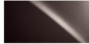
FIRE AGATE PEARL 04V3