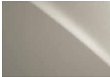
ATOMIC SILVER 01J7