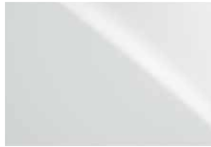
ULTRA WHITE 0083