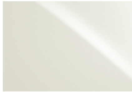
STARFIRE PEARL 0077