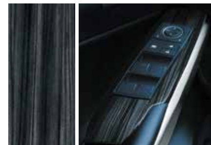
DARK CHARCOAL WOOD