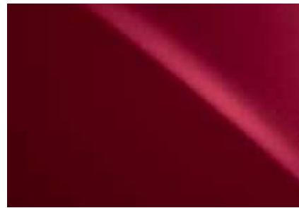
MATADOR RED MICA 03R1