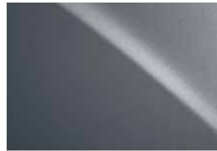
NEBULA GREY PEARL 01H9