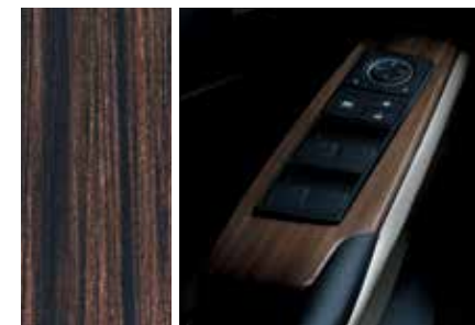
DARK BROWN WOOD