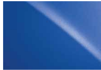
ULTRASONIC BLUE MICA 08U1