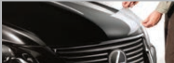
PAINT PROTECTION FILM