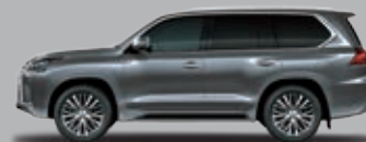
NEBULA GREY PEARL.....01H9