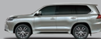
ATOMIC SILVER .....01J7