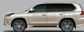
SATIN CASHMERE METALLIC.....04U7