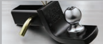
HITCH BALL 2" - 6,000 LBS