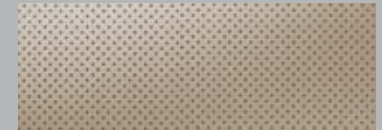
PREMIUM LEATHER - PERFORATED | PARCHMENT