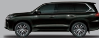
STARLIGHT BLACK MICA.....0217