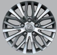
Standard 20" split 5-spoke alloy wheels