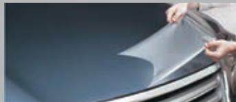
PAINT PROTECTION FILM