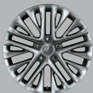
ES 350 (optional) 18" split 10-spoke alloy wheels