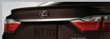
REAR SPOILER (ES 350)