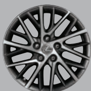
ES 350 (optional) 17" split 10-spoke alloy wheels