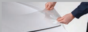
PAINT PROTECTION FILM