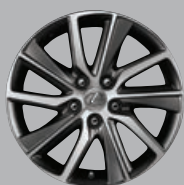
ES 300h 17" split 5-spoke alloy wheels