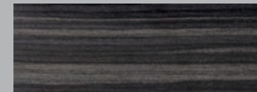
SHIMAMOKU WOOD TRIM