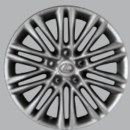
ES 350 17" split 10-spoke alloy wheels